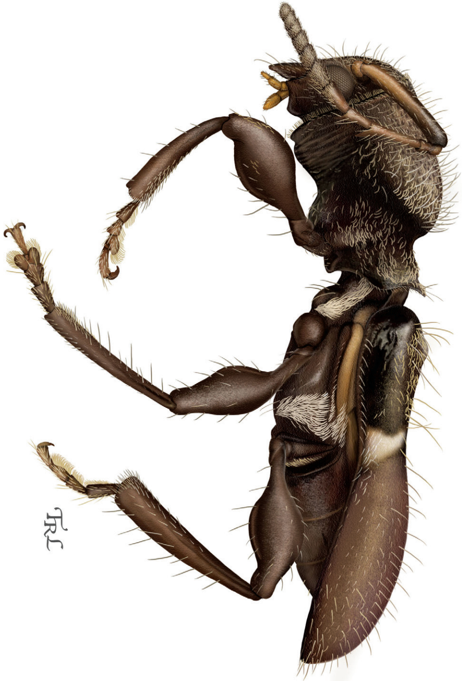
Figure 2. Licracantha formicaria sp. n., lateral habitus. Digital painting by Taina Litwak.