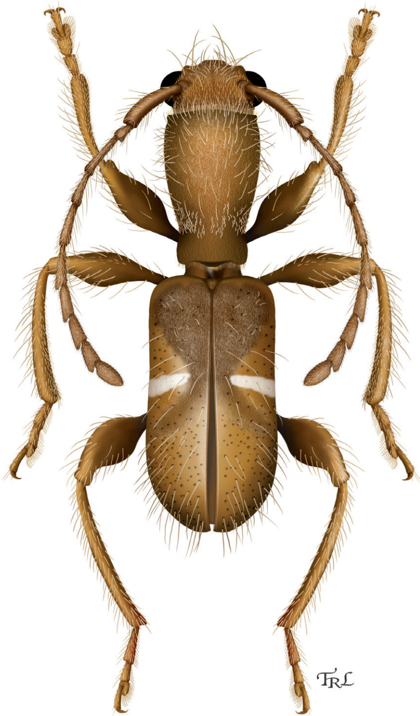
Figure 4. Tilloclytus baoruco sp. n., dorsal habitus. Digital painting by Taina Litwak.