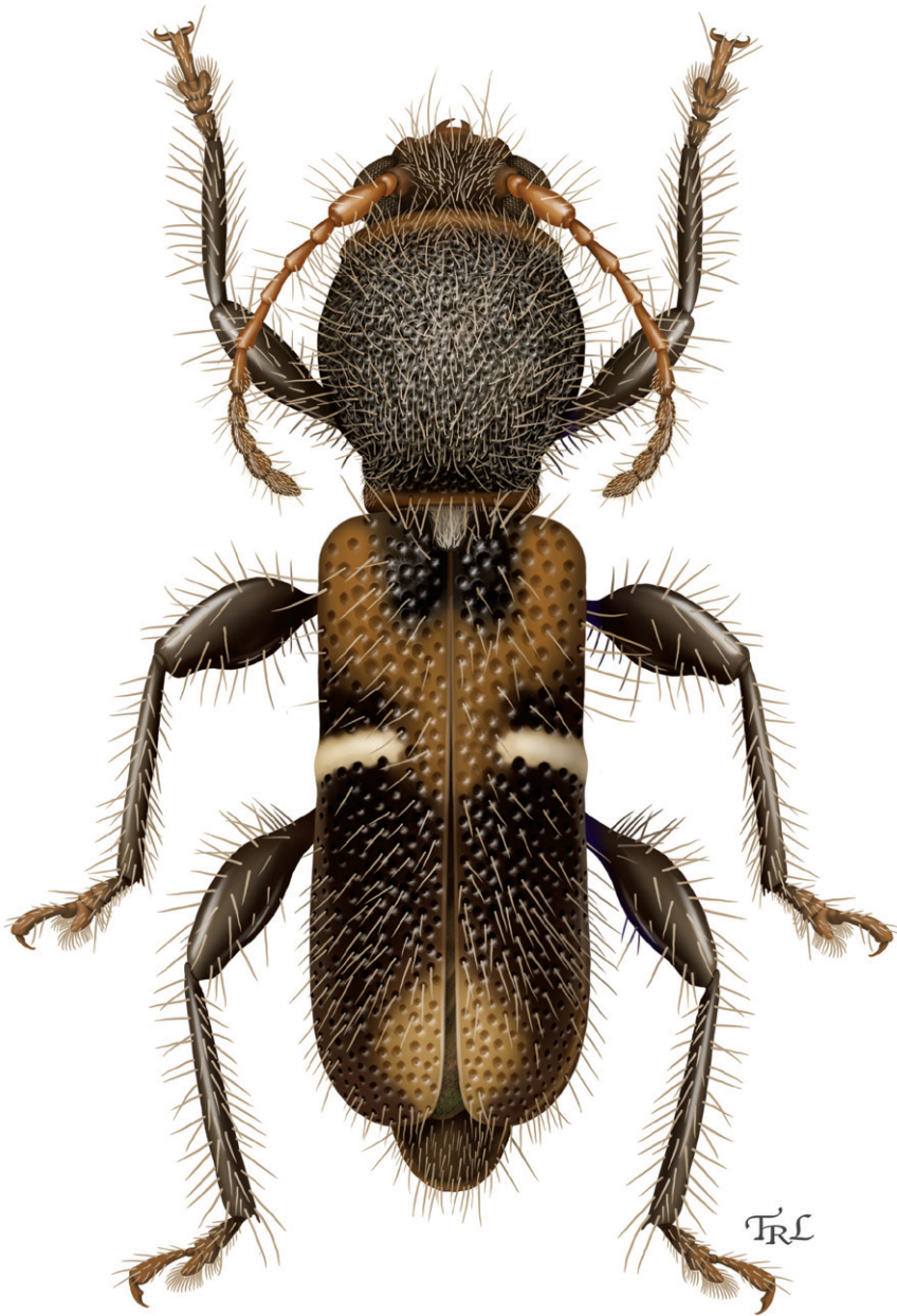
Figure 3. Callichytus macoris sp. n., dorsal habitus. Digital painting by Taina Litwak.