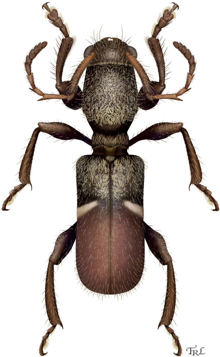
Figure 1. Licracantha formicaria sp. n., dorsal habitus. Digital painting by Taina Litwak.