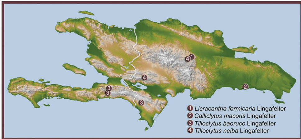
Map I. Distribution of ant-mimic longhorned beetles of tribes Tillomorhini and Anaglyptini in Hispaniola.