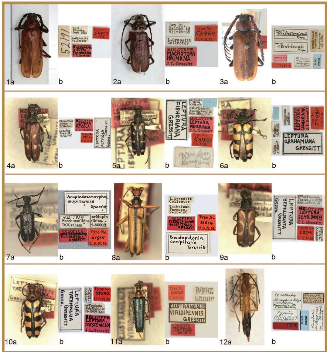
Fig. 1, Macrotoma fisheri formosae Gressitt (a, dorsal habitus; b, labels); Fig. 2, Macrotoma hainana Gressitt (a, dorsal habitus; b, labels); Fig. 3, Flabelloprionus szechuanus Heyrovský (a, dorsal habitus; b, labels); Fig. 4, Leptura alticola Gressitt (a, dorsal habitus; b, labels); Fig. 5, Leptura fisheriana Gressitt (a, dorsal; b, labels); Fig. 6, Leptura grahamiana Gressitt (a, dorsal habitus; b, labels); Fig. 7, Anoplocleromorpha mupinensis Gressitt (a, dorsal habitus; b, labels); Fig. 8, Pseudopidonia occipitalis Gressitt (a, dorsal habitus; b, labels); Fig. 9, Leptura semilunata Gressitt (a, dorsal habitus; b, labels); Fig. 10, Leptura tatsienluea Gressitt (a, dorsal habitus; b, labels); Fig. 11, Eustrangalis viridipennis Gressitt (a, dorsal habitus; b, labels); Fig. 12, Necydalis hirayamai Ohbayashi (a, dorsal habitus; b, labels).