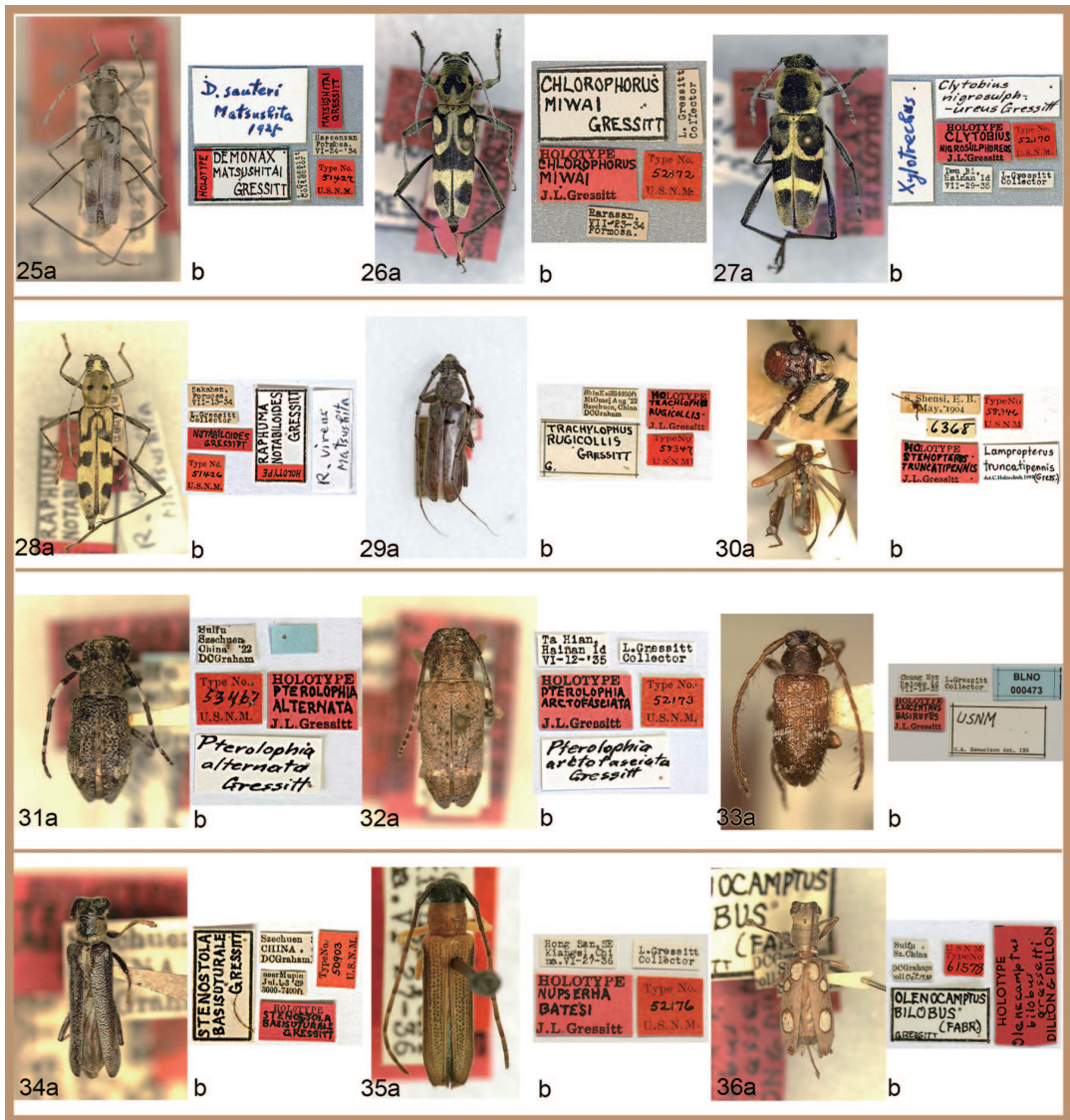
Fig. 25, Demonax matsushitai Gressitt (a, dorsal habitus; b, labels); Fig. 26, Chlorophorus miwai Gressitt (a, dorsal habitus; b, labels); Fig. 27, Xylotrechus nigrosulphureus Gressitt (a, dorsal habitus; b, labels); Fig. 28, Raphuma notabiloides Gressitt (a, dorsal habitus; b, labels); Fig. 29, Trachylophus rugicollis Gressitt (a, dorsal habitus; b, labels); Fig. 30, Stenopterus truncatipennis Gressitt (a, dorsal habitus and head; b, labels); Fig. 31, Pterolophia alternata Gressitt (a, dorsal habitus; b, labels); Fig. 32, Pterolophia arctofasciata Gressitt (a, dorsal habitus; b, labels); Fig. 33, Exocentrus basirufus Gressitt (a, dorsal habitus; b, labels); Fig. 34, Stenostola basisuturale Gressitt (a, dorsal habitus; b, labels); Fig. 35, Nupserha batesi Gressitt (a, dorsal habitus; b, labels); Fig. 36, Olenecamptus bilobus gressitti Dillon and Dillon (a, dorsal habitus; b, labels).