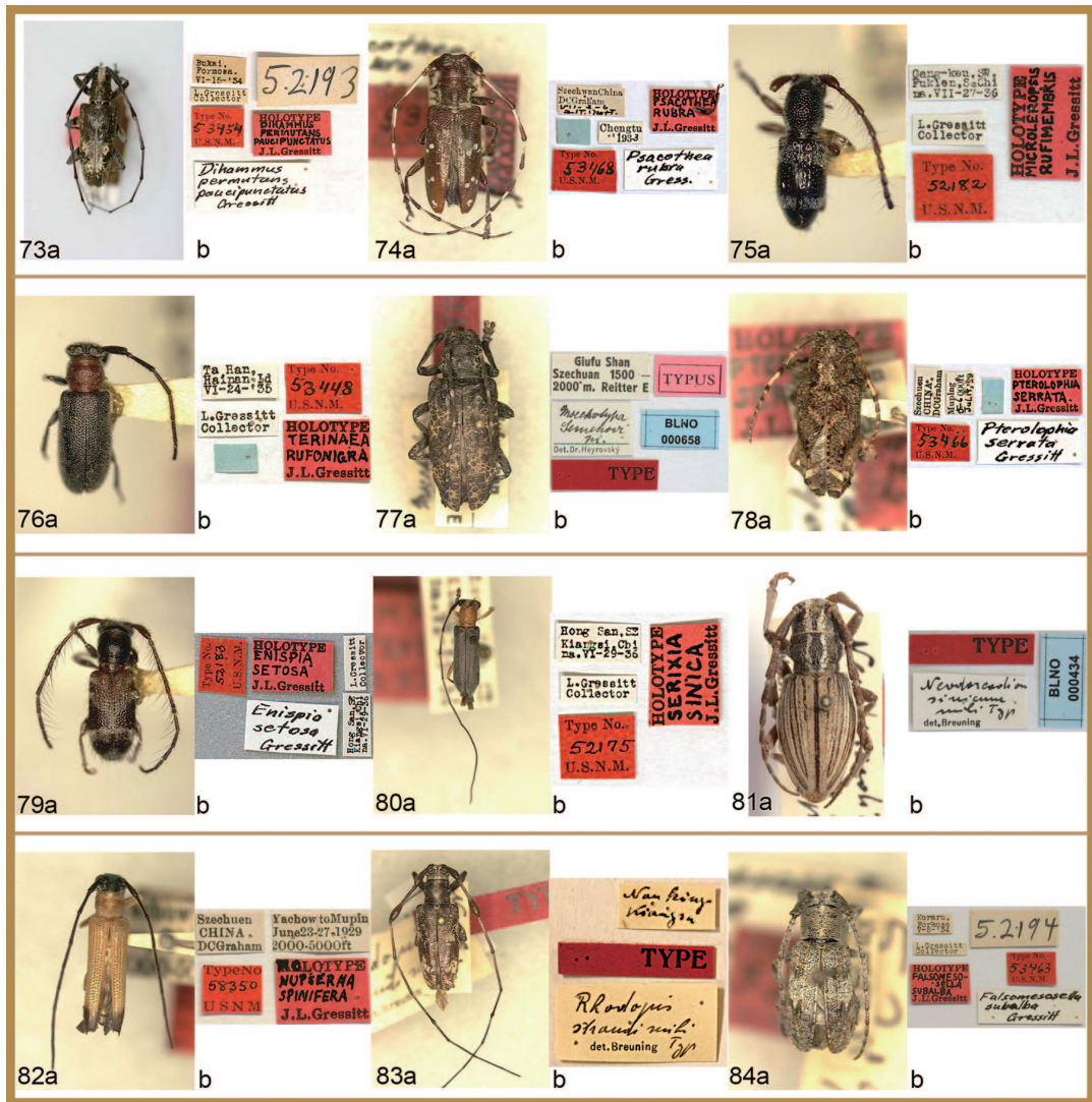
Fig. 73, Dihammus permutans paucipunctatus Gressitt (a, dorsal habitus; b, labels); Fig. 74, Psaethea rubra Gressitt (a, dorsal habitus; b, labels); Fig. 75, Microleropsis rufimembris Gressitt (a, dorsal habitus; b, labels); Fig. 76, Terinaea rufonigra Gressitt (a, dorsal habitus; b, labels); Fig. 77, Moechotypa semenovi Heyrovský (a, dorsal habitus; b, labels); Fig. 78, Pterolophia serrata Gressitt (a, dorsal habitus; b, labels); Fig. 79, Enispia setosa Gressitt (a, dorsal habitus; b, labels); Fig. 80, Serixia sinica Gressitt (a, dorsal habitus; b, labels); Fig. 81, Eodorcadion (Ornatodorcadion) sinicum Breuning (a, dorsal habitus; b, labels); Fig. 82, Nupserha spinifera Gressitt (a, dorsal habitus; b, labels); Fig. 83, Rhodopis strandi Breuning (a, dorsal habitus; b, labels); Fig. 84, Falsomesosella subalba Gressitt (a, dorsal habitus; b, labels).