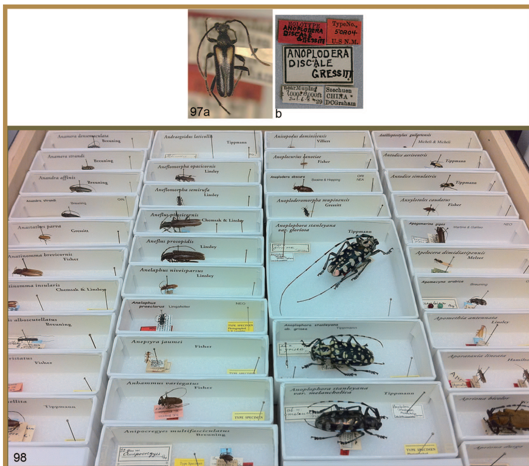
Fig. 97, Anoplodermomorpha discale Gressitt (a, dorsal habitus; b, labels); Fig. 98, example of one drawer of primary types in the Smithsonian Institution collection.