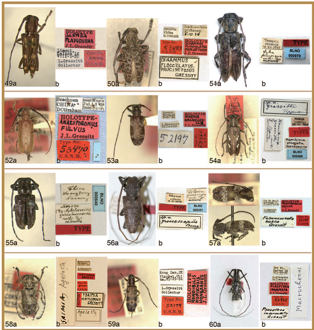
Fig. 49, Glenea flavorubra Gressitt (a, dorsal habitus; b, labels); Fig. 50, Dihammus flocculatus paucisetosus Gressitt (a, dorsal habitus; b, labels); Fig. 51, Sybra formosana Breuning (a, dorsal habitus; b, labels); Fig. 52, Anaesopogonius fulvus Gressitt (a, dorsal habitus; b, labels); Fig. 53, Miaenia granulicolle Gressitt (a, dorsal habitus; b, labels); Fig. 54, Kamikirtia gressitti Tippmann (a, dorsal habitus; b, labels); Fig. 55, Mesosa (Aphelocnemia) griseomarmorata Breuning (a, dorsal habitus; b, labels); Fig. 56, Dihammus grossescapus Breuning (a, dorsal habitus; b, labels); Fig. 57, Falsomesosella hakka Gressitt (a, dorsal and lateral habitus; b, labels); Fig. 58, Saimia hirticornis Gressitt (a, dorsal habitus; b, labels); Fig. 59, Rondibilis horiensis hongshamus Gressitt (a, dorsal habitus; b, labels); Fig. 60, Psacotha inarmata Gressitt (a, dorsal habitus; b, labels).