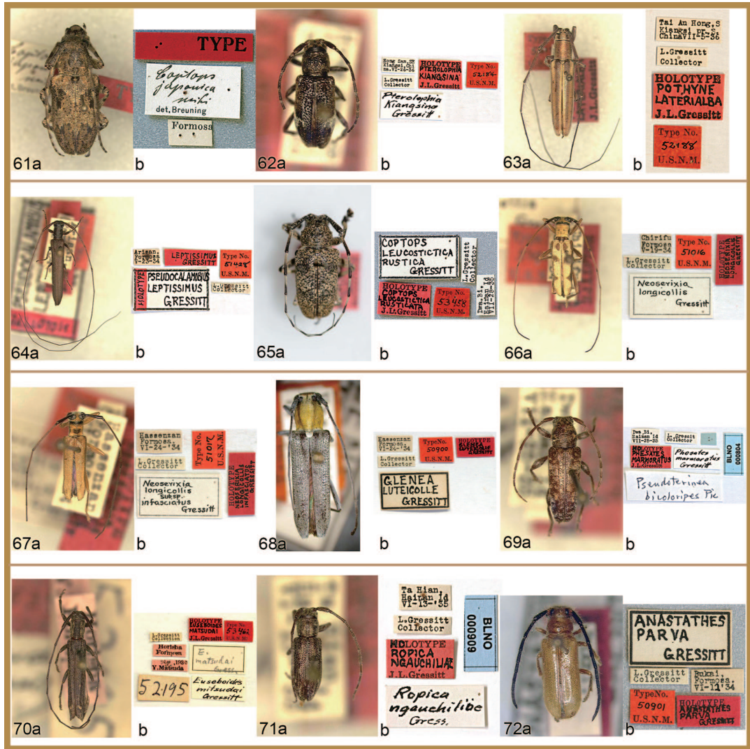
Fig. 61, Coptops japonica Breuning (a, dorsal habitus; b, labels). Fig. 62, Pterolophia kiangsina Gressitt (a, dorsal habitus; b, labels); Fig. 63, Pothyne (Lateralba) lateralba Gressitt (a, dorsal habitus; b, labels); Fig. 64, Pseudocalamobius leptissimus Gressitt (a, dorsal habitus; b, labels); Fig. 65, Coptops leucostictica rustica Gressitt (a, dorsal habitus; b, labels); Fig. 66, Neoserixia longicollis Gressitt (a, dorsal habitus; b, labels); Fig. 67, Neoserixia longicollis infasciatus Gressitt (a, dorsal habitus, b, labels); Fig. 68, Glenea luteicollis Gressitt (a, dorsal habitus; b, labels); Fig. 69, Presates marmoratus Gressitt (a, dorsal habitus; b, labels); Fig. 70, Euseboides matsudai Gressitt (a, dorsal habitus; b, labels); Fig. 71, Ropica ngauchiliae Gressitt (a, dorsal habitus; b, labels); Fig. 72, Anastathes parva Gressitt (a, dorsal habitus; b, labels).