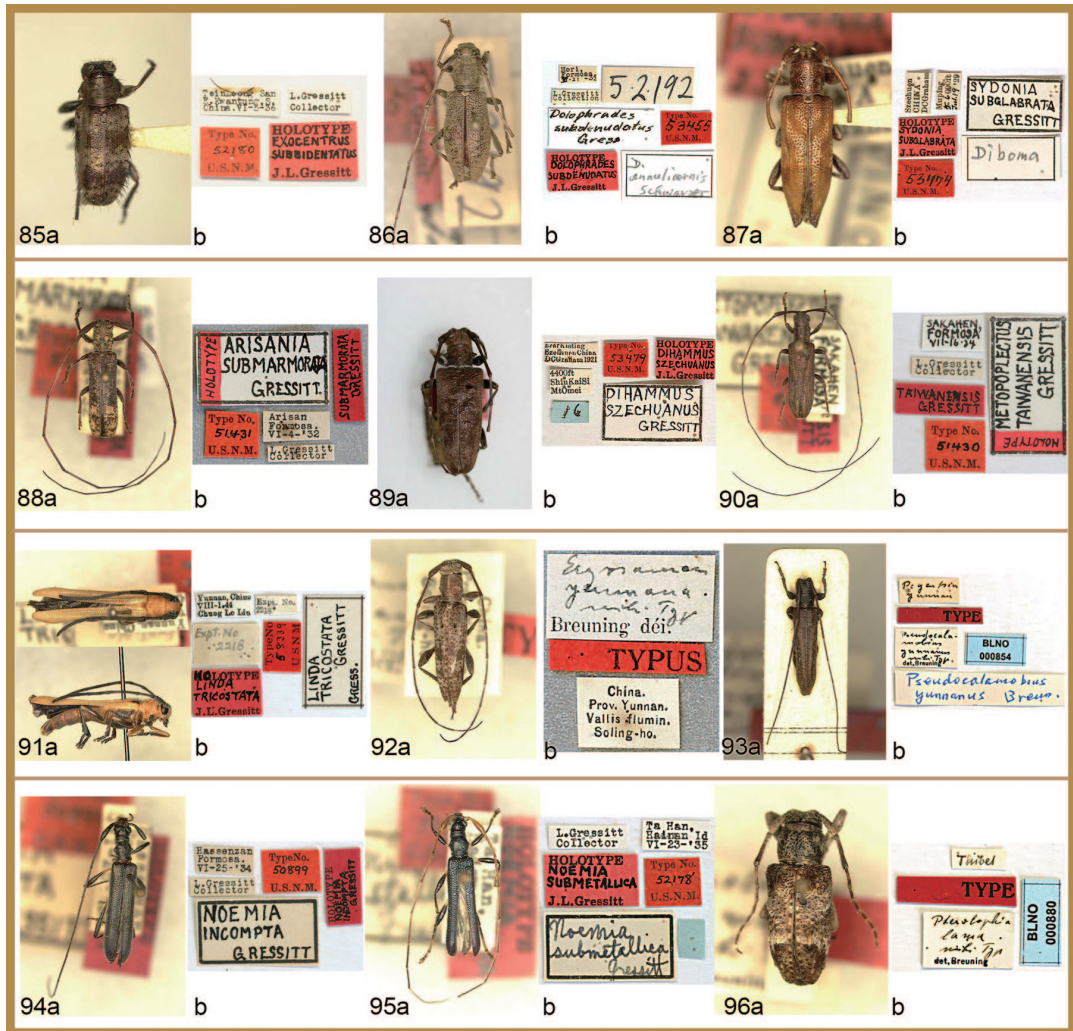
Fig. 85, Exocentrus subbidentatus Gressitt (a, dorsal habitus; b, labels); Fig. 86, Dolophrades subdenudatus Gressitt (a, dorsal habitus; b, labels); Fig. 87, Sydonia subglabrata Gressitt (a, dorsal habitus; b, labels); Fig. 88, Arisania submarmorata Gressitt (a, dorsal habitus; b, labels); Fig. 89, Dihammus szechuanus Gressitt (a, dorsal habitus; b, labels); Fig. 90, Metopoplectus taiwanensis Gressitt (a, dorsal habitus; b, labels); Fig. 91, Linda tricostrata Gressitt (a, dorsal and lateral habitus; b, labels); Fig. 92, Eryssamena yunnana Breuning (a, dorsal habitus; b, labels); Fig. 93, Pseudocalamobius yunnanus Breuning (a, dorsal habitus; b, labels); Fig. 94, Noemia incompta Gressitt (a, dorsal habitus; b, labels); Fig. 95, Noemia submetallica Gressitt (a, dorsal habitus; b, labels); Fig. 96, Pterolophia lama Breuning (a, dorsal habitus; b, labels).

Type Locality: China: Yunnan Province, Peycupin