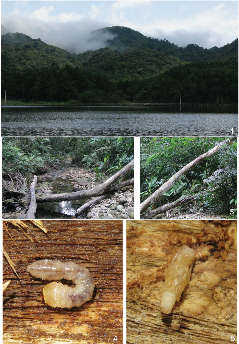
Figures 1–5. Glenea diversenotata Schwarzer, 1925 from Hainan, Diaoluoshan, taken in 2010.IV.23, by Zi-Wei Yin. 1 The broad-leaved forest located in Hainan, Diaoluoshan 2–3 A large decomposing log with Glenea diversenotata Schwarzer, 1925 inside 4 Larva 5 Pupa.