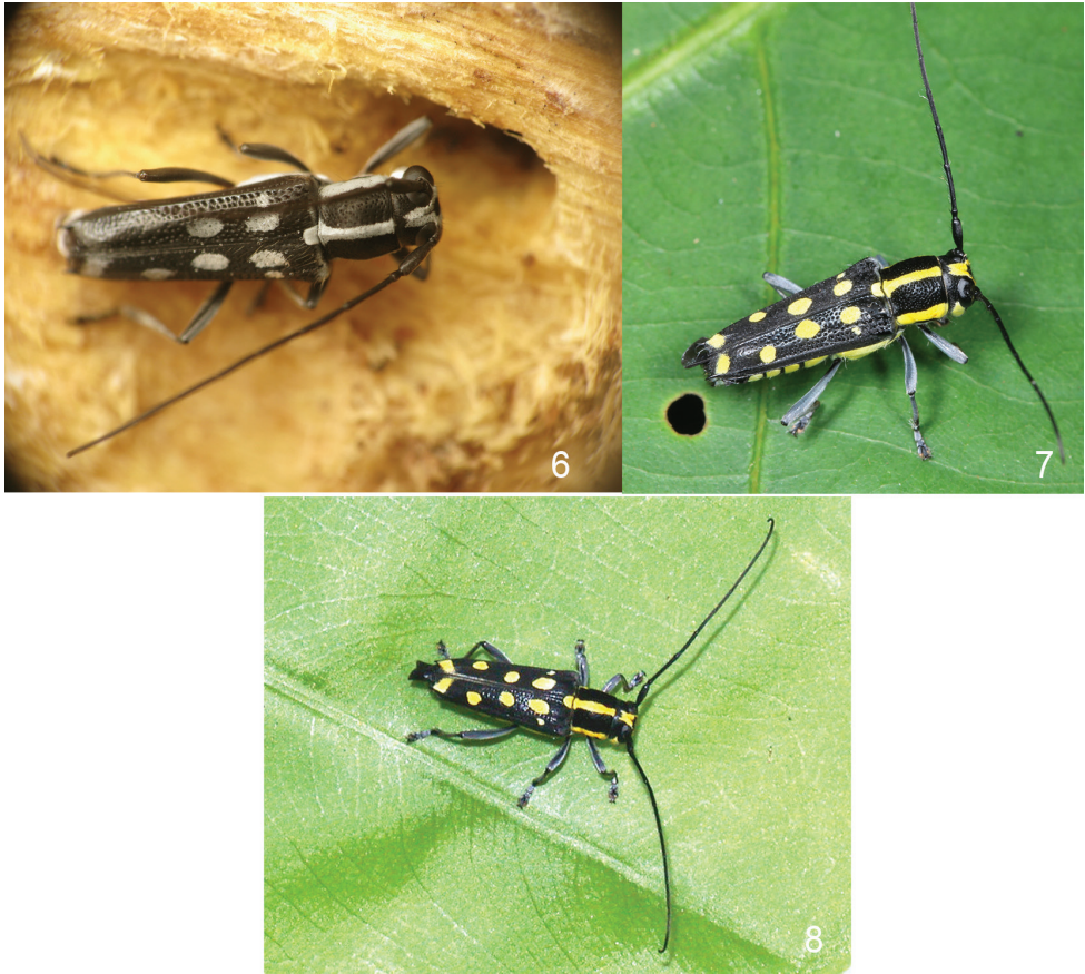
Figures 6–8. Glenea diversenotata Schwarzer, 1925, adult, live pictures. 6 A fresh emerged adult from the log in fig. 2, from Hainan, Diaoluoshan, showing the white pubescence, taken in 2010.IV.23 7 An active adult from Hainan, Jianfengling, showing the yellow pubescence, taken in 2011.V.23 8 An active adult from Taiwan, Dahanshan, showing the yellow pubescence, taken in 2010.VIII.29.

Glenea ( s. str. ) lacteomaculata ; Gressitt 1951: 575.